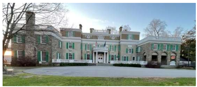
FDR Home – Hyde Park

Battles, West Point, historic homes of FDR and Eleanor, the Baseball Hall of Fame, and more.