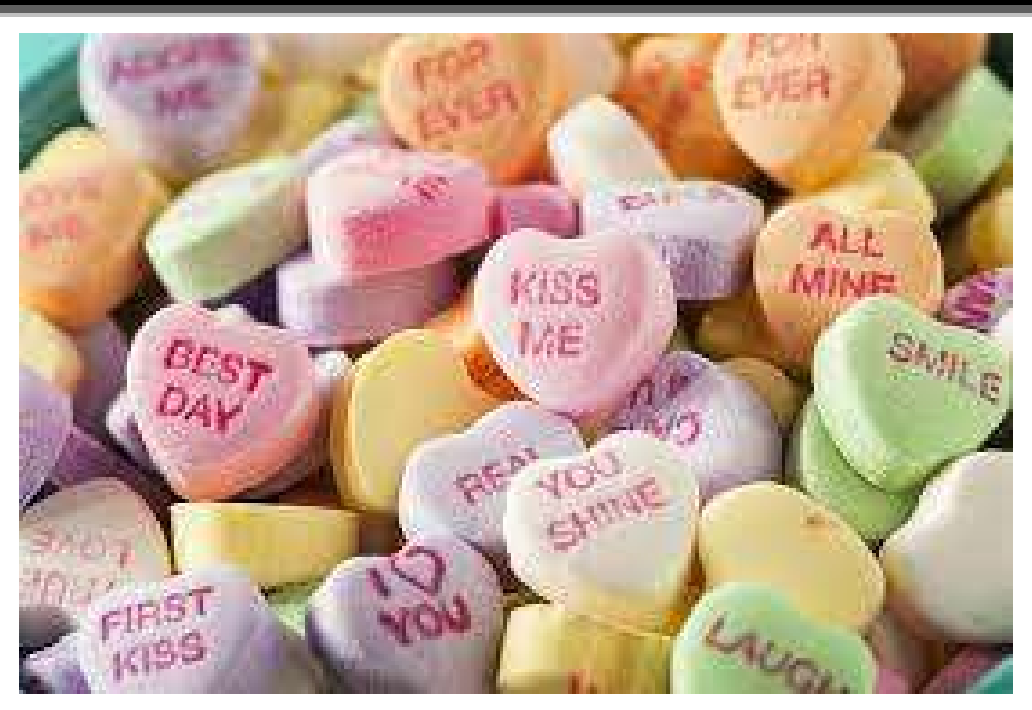
Don't Forget Your Valentine

Please provide any pictures, updates and corrections for newsletter or website to: <u>dbutler@tuscolakiwanis.org</u> or <u>jbutler@tuscolakiwanis.org</u>