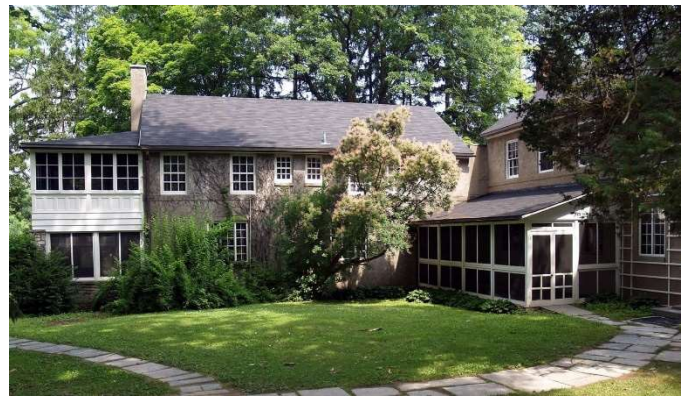
Elenor's Home – Hyde Park