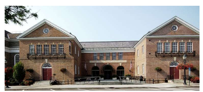
Baseball Hall of Fame - Cooperstown